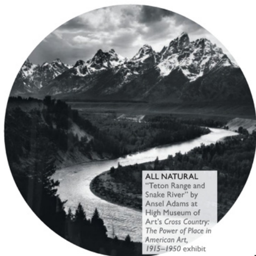
ALL NATURAL "Teton Range and Snake River" by Ansel Adams at High Museum of Art's Cross Country: The Power of Place in American Art, 1915–1950 exhibit